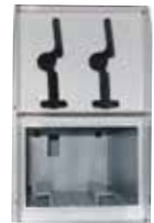
Prep for Coin ("X")