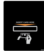
Prep for Card ("Y")